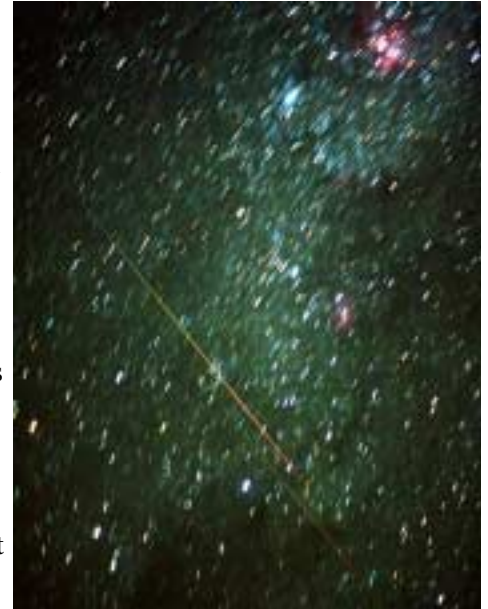
Two bright Leonids cross the Milky Way

Carter, keeping a close eye on the time, stated loudly that the predicted time of the radiant rise had arrived when almost immediately, a bright fireball issued forth from the sickle of Leo and soared straight overhead, arcing across the star-studded dome of the night sky all the way down to the opposite horizon, with two smaller, shorter-lived meteors flashing behind and to either side of the first one's path like twin fighter-jet escorts to the President's plane. I don't remember which was louder: the oohs! and ahhs! of the audience, or the clicking of the forest of opening camera shutters around me in the dark. Whoa! Just who does that Carter think he is, anyway?? From that point on, we began to see meteors in dribs and drabs every few minutes, the majority of them being pretty large and bright. The crowd had gotten into a game of calling out the general region of the sky (left, right, above, behind) whenever someone spotted one, and as the morning progressed, these calls became faster with shorter time periods between. I noticed the well-known effect that those meteors close to the radiant were of short length and duration, some of which were so short they seemed to pop, like a flash-