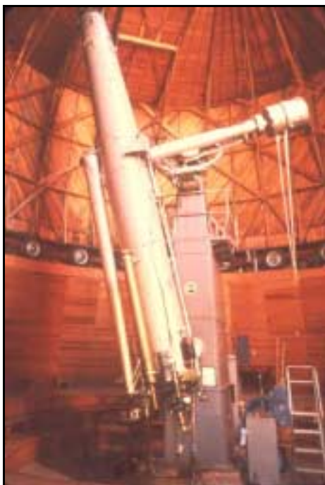
The 24-inch refracting telescope, purchased by Percival Lowell for $20,000 in 1896, was built by famed telescope maker Alvan Clark in Boston, Massachusetts. Percival Lowell used this telescope to study Mars and Halley's Comet with this instrument. In the 1920s, V.M. Slipher used it to discover the first evidence of receding galaxies.

Just a year later, on February 18, 1930, Tombaugh analyzed plates made on January 23 and 29, using a Zeiss blink comparator. According to Tombaugh, "After scanning a few fields to the left, I turned the next field into view. Suddenly I spied a fifteenth magnitude image popping out and disappearing in the